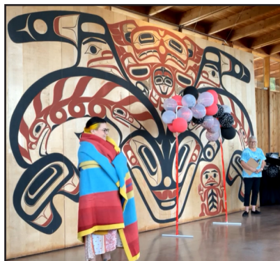
Scenes from the 2022 PGST graduate ceremony in the Longhouse

On June 15, the Port Gamble S'Klallam Tribe celebrated our 2022 high school and college graduates.