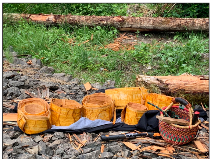
Below: A few of the strips of cedar collected during the harvesting on Rayonier lands