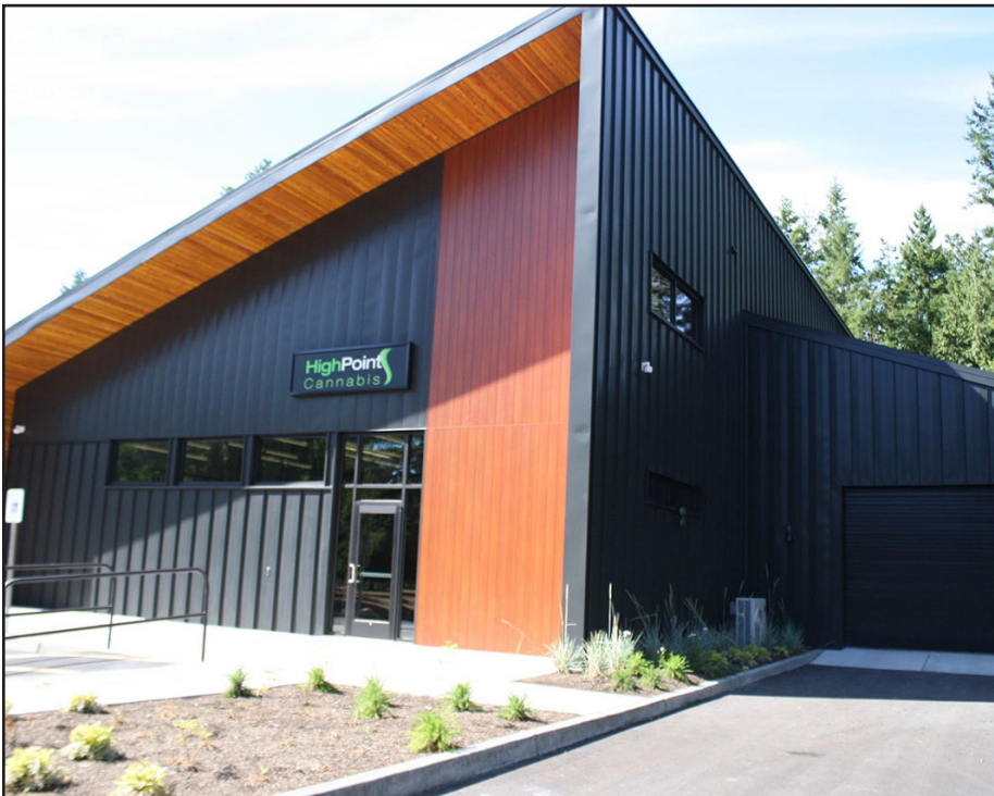
High Point's new building on NE Hansville Rd. is now open.

High Point Cannabis has moved into its new building at 30521 NE Hansville Road in Kingston.