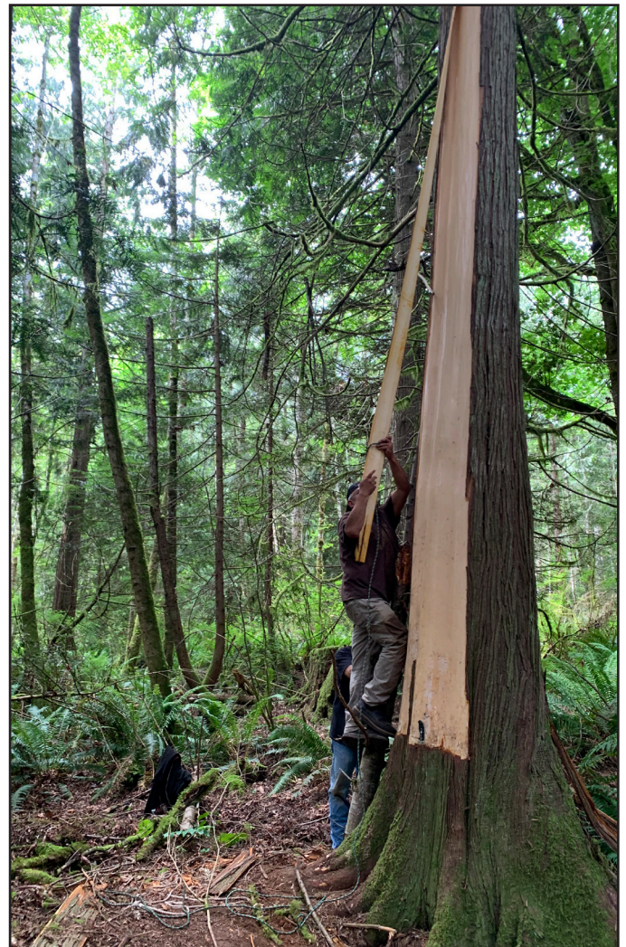
Above: the process of harvesting cedar

Overall, I would say the harvest was a success and we all got some gorgeous cedar out of it that we will get to use for future projects.