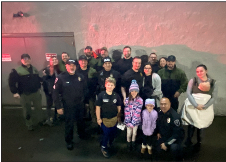
Kids and cops participating in 2023 Shop with a Cop

On Saturday, December 2, at the Poulsbo Walmart, law enforcement officers throughout Kitsap County, including from PGST's Public Safety team, and members of the local