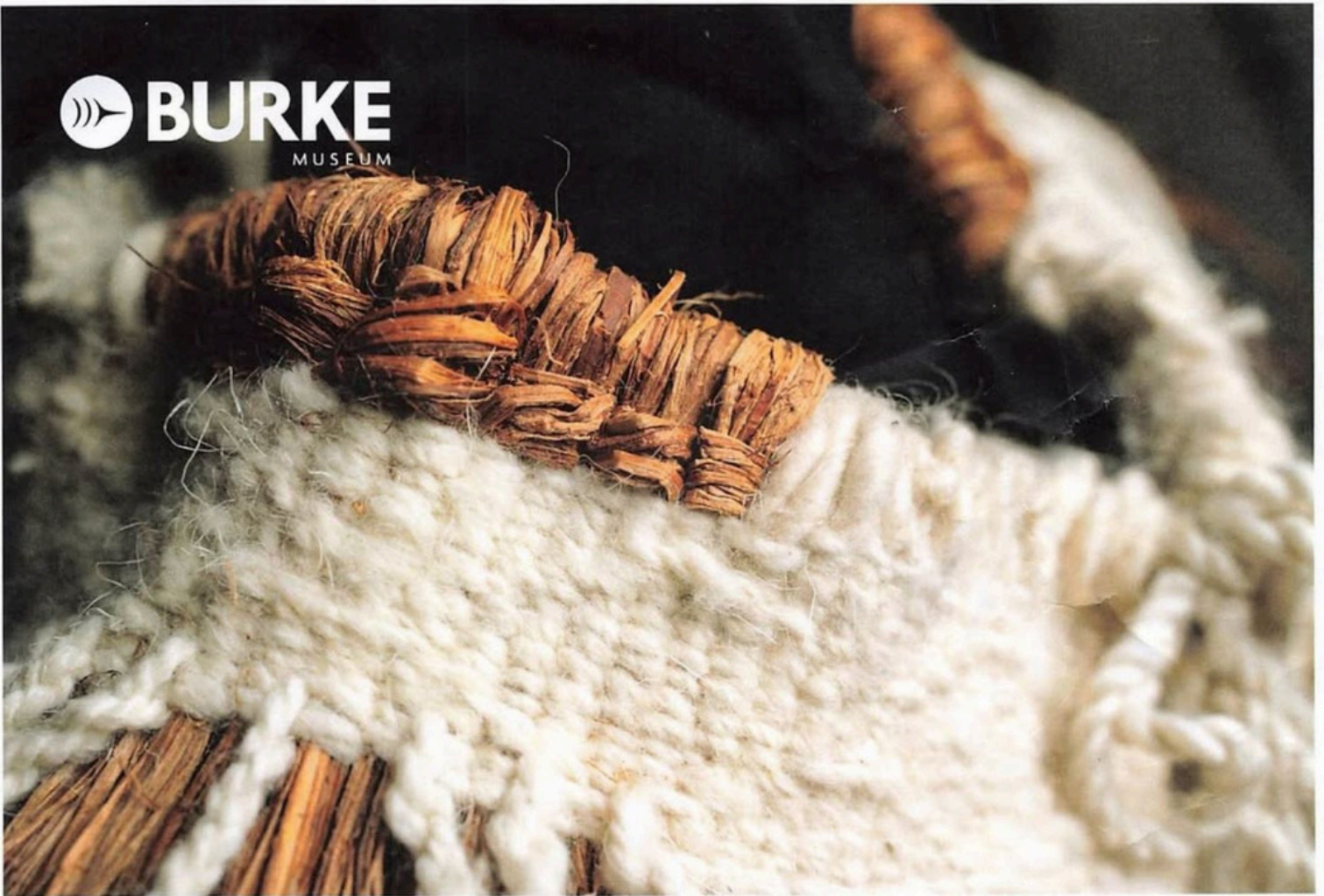
Mountain Protector, Cape (detail), 2025. SiSeeNaxAlt Gail White Eagle (Muckleshoot). Yellow cedar and mountain goat wool.