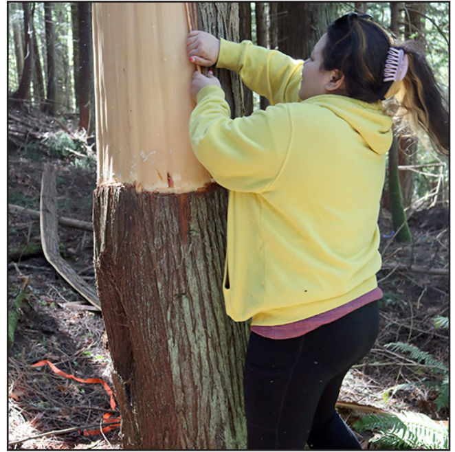
Photos from a recent cedar harvest facilitated by the Cultural Resources Department